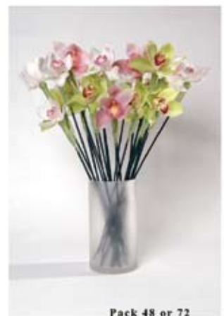
PACK 48 or 72

Turning Ordinary into Elegant. Premium Cymbidium Blooms Long-Life Water Tube Floral Stick, 22” Long No wiring required, blooms shipped ready to assemble.